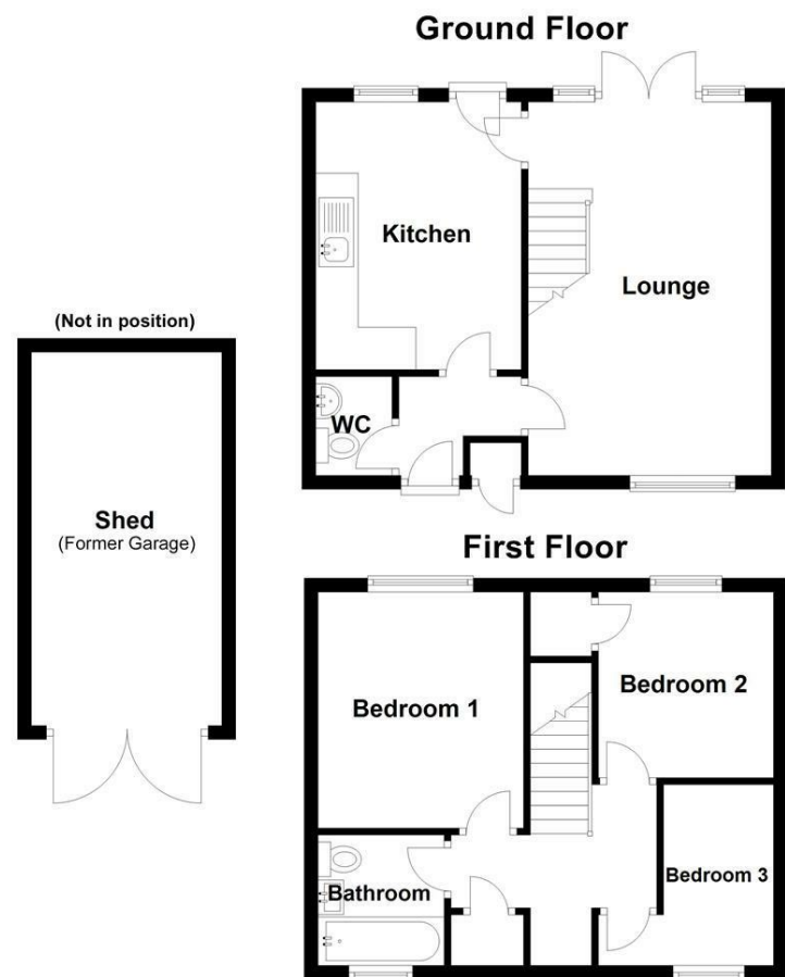
Not to scale. For illustrative purposes only